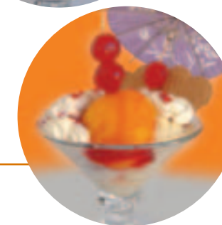
Pessego Melba "Peach Melba" 6,50€