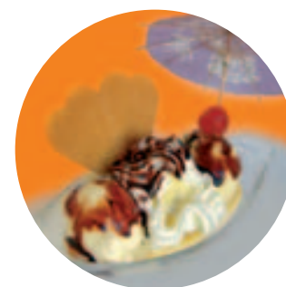
Banana Split 6,50€