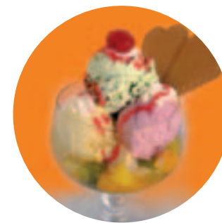
Four Seasons 7,00€