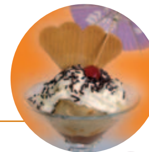
Cascata "Waterfall" 5,50€