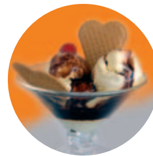
Dama Branca "White Lady" 4,50€